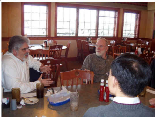
an opportunity for discussion