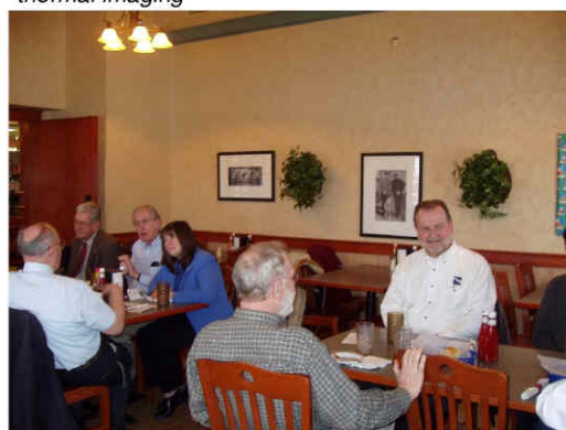
Catching up with new and long time members