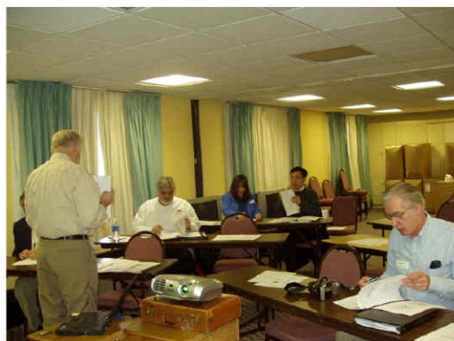
Attendees earned .3 ceu's