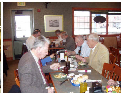
Ryan's Buffet offered plenty of choices