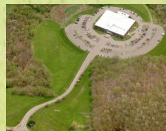
Michael Baker Facility – Beaver, PA