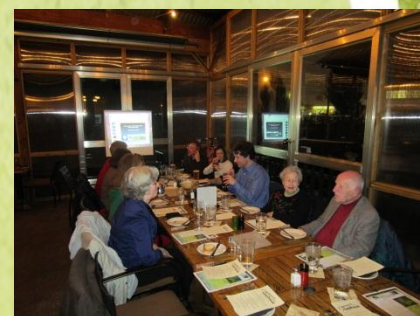
Ann Arbor, Michigan